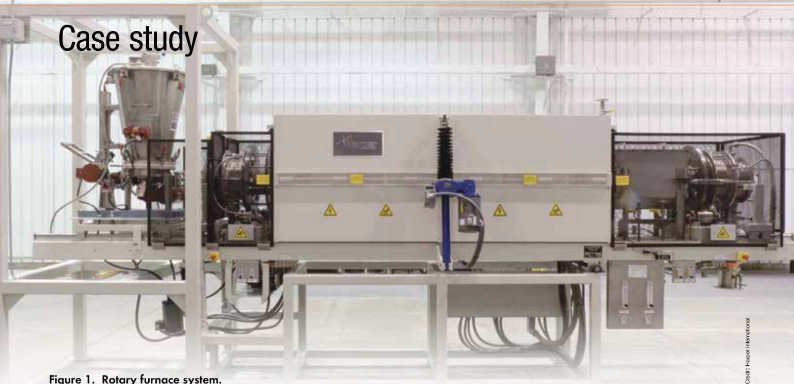
Figure 1. Rotary furnace system.